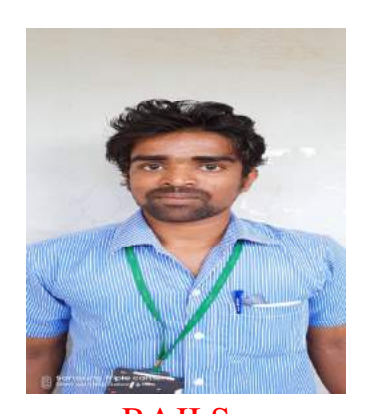
RAJI S EEE